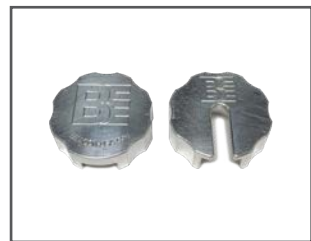
Disk Wrench Set

Replacement cost for damaged or lost items: $105 per Sorbent Sampler, $35 per Diffusion Cap and $50 per Disk Wrench Set