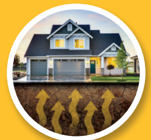
Vapor Intrusion Monitoring